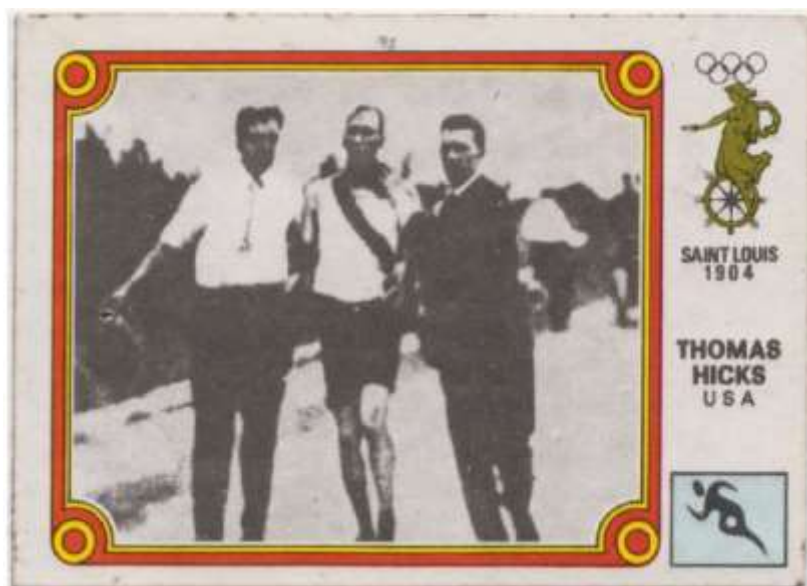
THOMAS HICKS USA (Panini, 1976)

Similarly, the Italian company Panini circulated the following image for the 1976 Olympic Games - Montreal (Canada). As you can see, the image has been cropped to focus only on the three people in the foreground.