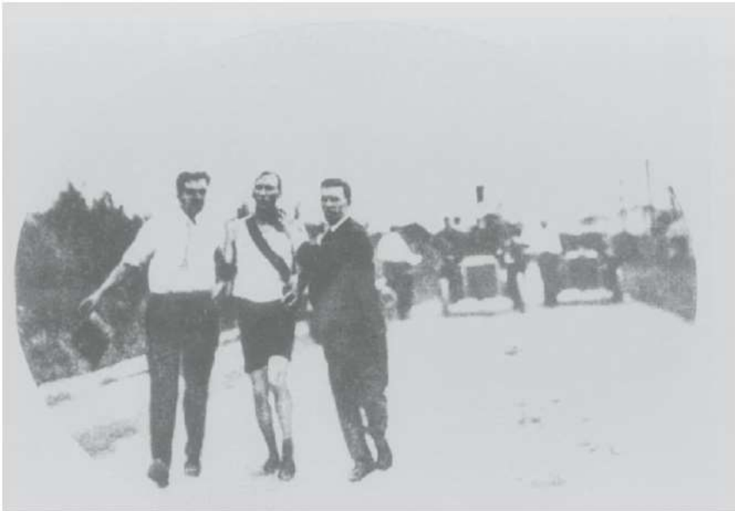
American Thomas Hicks is helped by his teammates in the marathon at the 1904 St. Louis Olympic Games

Similarly, the Italian company Panini circulated the following image for the 1976 Olympic Games - Montreal (Canada). As you can see, the image has been cropped to focus only on the three people in the foreground.